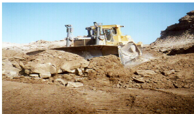
Fig. 6 The Vršany Mine – sandstones with carbonate cement after blasting

The situation of the Vršany mine sandstones (after blasting and before crushing) is shown in the following photo (Figure 6). The main parameters of the Vršany mine hard structures are shown in the Table 2.