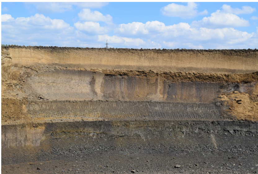
Fig. 7 Situation of the Libous mine first overburden cut rocks