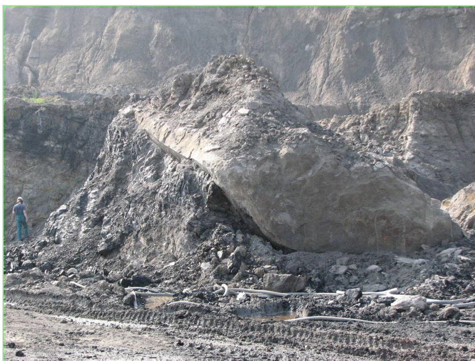
Fig. 3 Boulder of sandstone with dolomite cement

We started the testing of survey method after finishing of the Bílina Mine hard structures research. The large boulder of sandstone with dolomite cement is shown in the following photo (Figure 3).