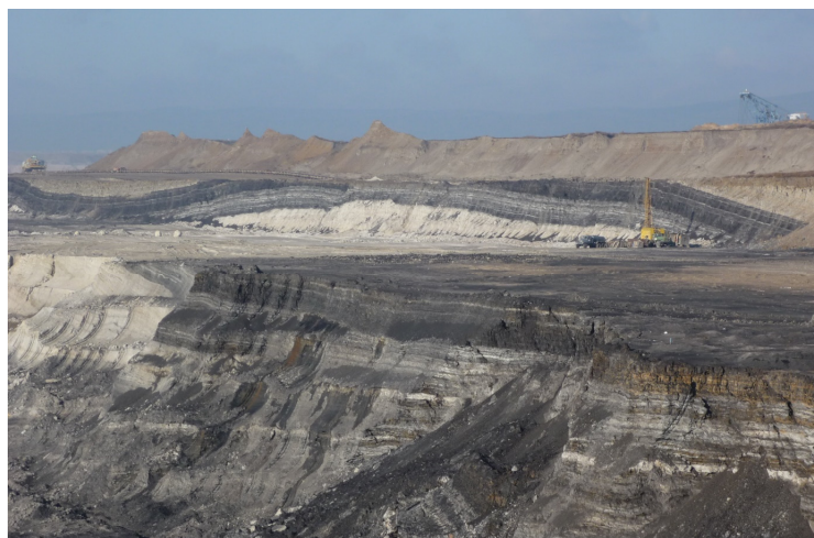
Fig. 5 The Vršany Mine – situation of the overburden cut