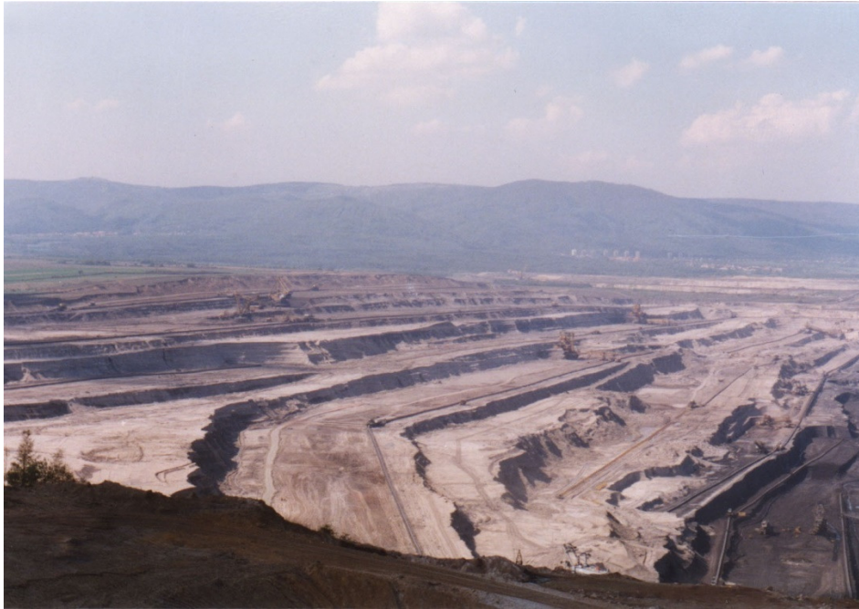
Fig. 2 The Bílina Mine – situation of the overburden cuts

The main types of the overburden rocks are clays, sandy clays and sands. The value of comprehensive strength ranges between 0 (sands) to 2,5 MPa, the content of clay minerals ranges between 10 to 70%, the value of density ranges between 1900 to 2050 kg/m 3 and the texture of rocks is layered or clastic.