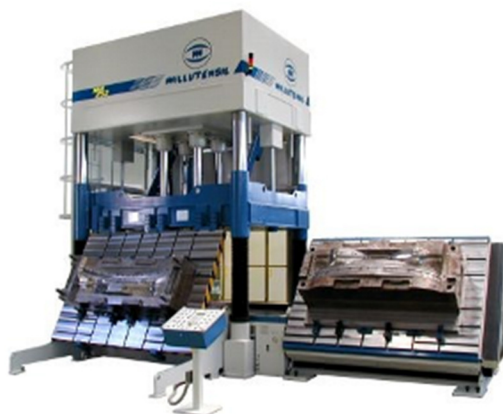
Fig. 1. Spotting press used for large-size molds quality control process